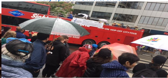
Spirits were not dampened by a bit of rain when the Ukulelians played their music in the 121st Island Farms Victoria Day Parade, atop a donated Wilson's double-decker Sightseeing Bus.